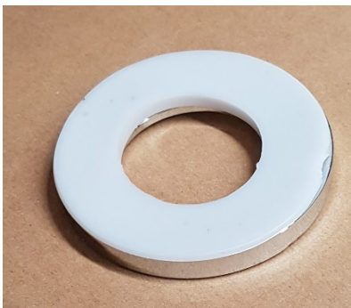
Completed seating ring

Contains O-ring, spacer seal and chrome seating ring