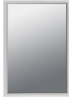
White gloss framed 450/550/900/1200 all 680 high