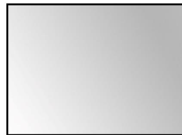
MIDNIGHT MIRROR 900 x 750 x 20 ALUMINIUM FRAME MATT BLACK CAN BE MOUNTED LANDSCAPE OR PORTRAIT