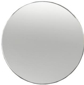
Round Bevelled 400mm or 600mm