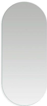
ELLA Mirror Polished edge 800 x 400 x 5