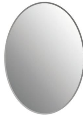
Oval Bevelled 500 x 700 5mm Bevelled edge