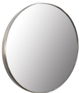
Gun Metal Grey