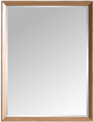
Oslo Mirror 700 X 900 X 35 1200 X 700 X 35