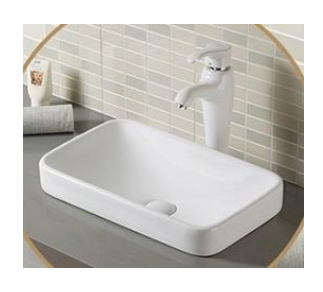
BAILEY SEMI INSET 480 X 300 X 60 out