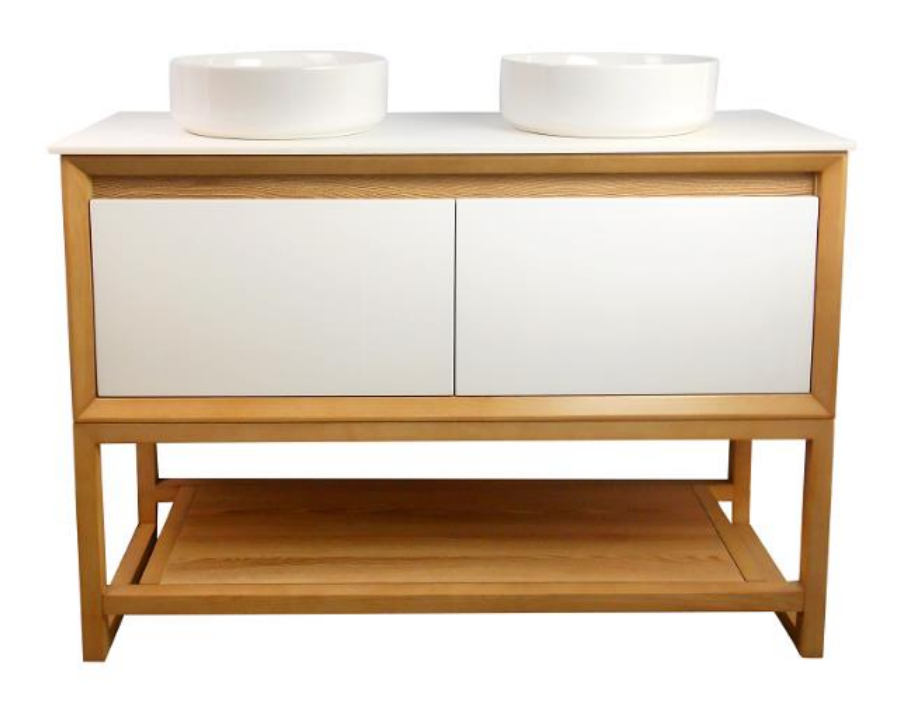
32mm Plug and waste required