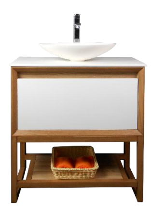
32mm Plug and waste required